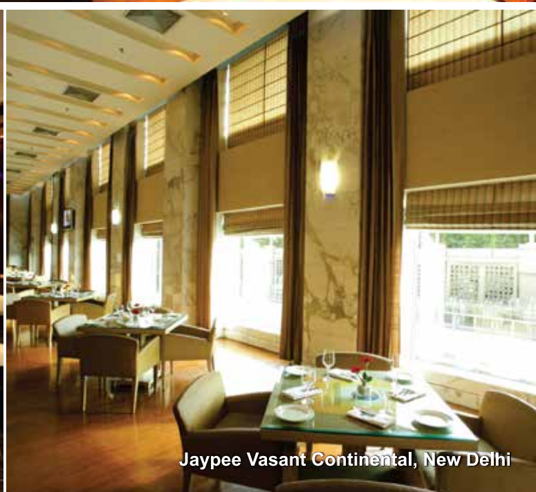
Jaypee Vasant Continental, New Delhi