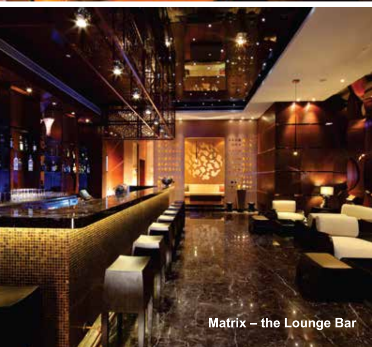
Matrix – the Lounge Bar