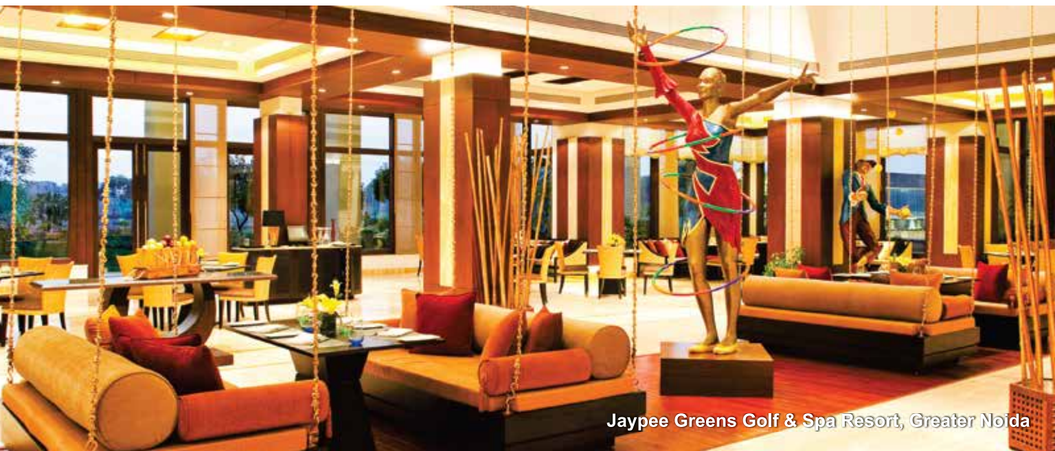
Jaypee Greens Golf & Spa Resort, Greater Noida