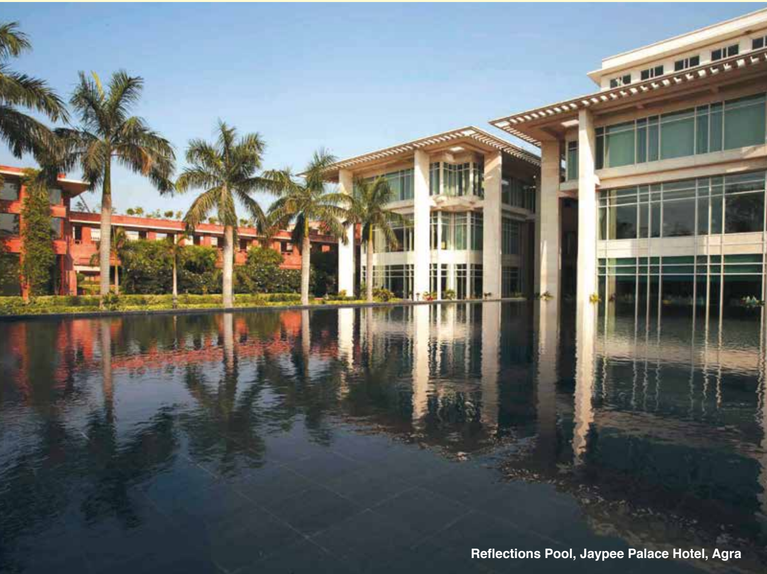
Reflections Pool, Jaypee Palace Hotel, Agra