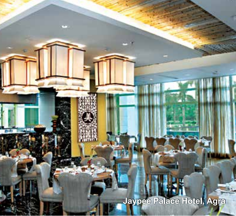
Jaypee Palace Hotel, Agra