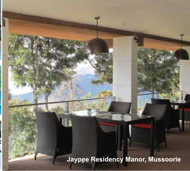
Jaypee Residency Manor, Mussoorie